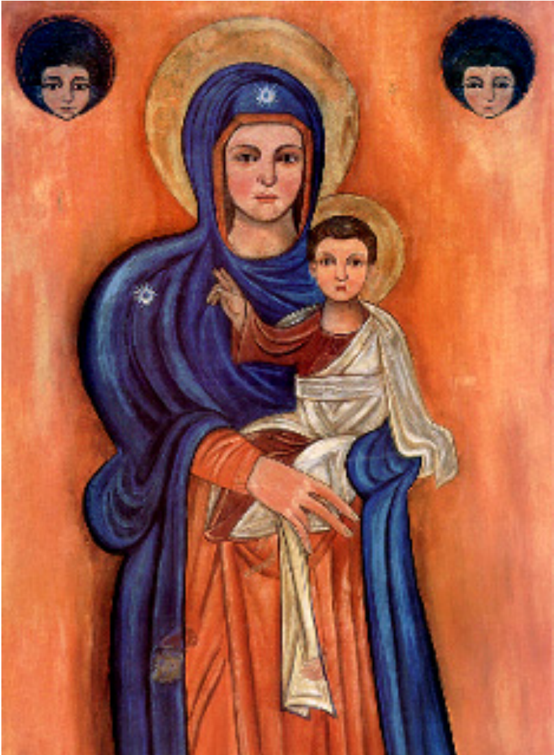
Our Lady of Elige, Our Lady of the Maronites