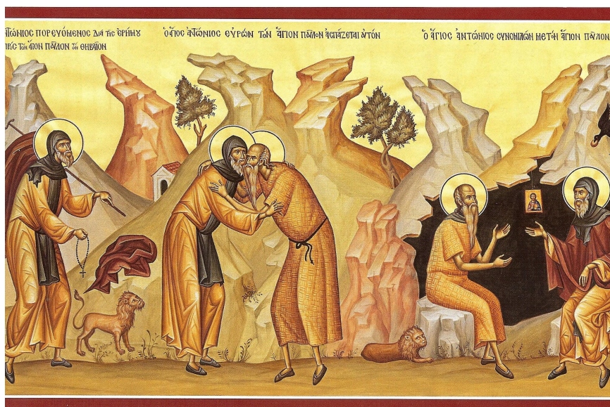
Abba Paul of Thebes and Abba Anthony