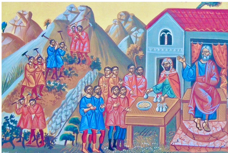
Laborers in the Vineyard