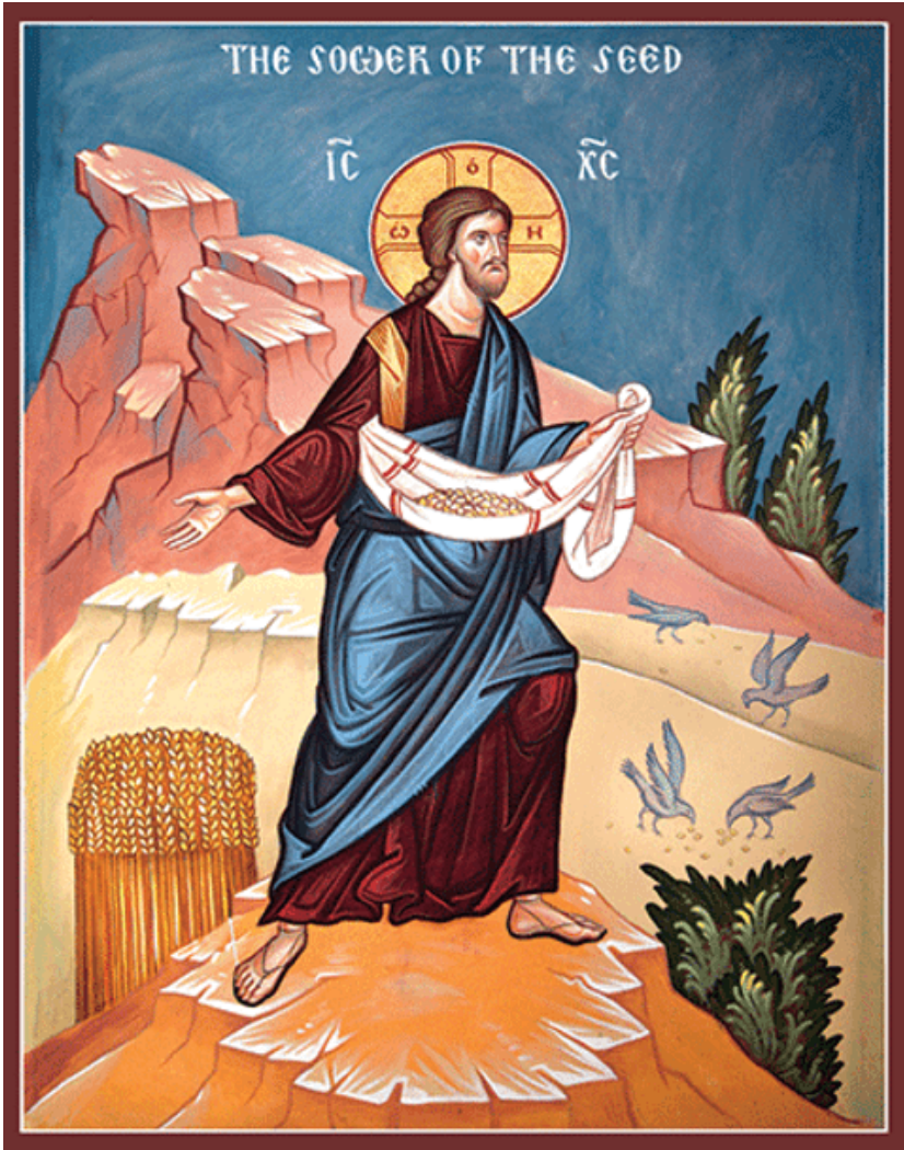
Christ the Sower