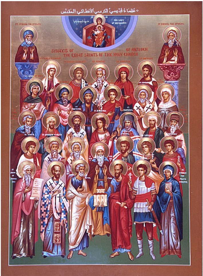
Saints of Antioch