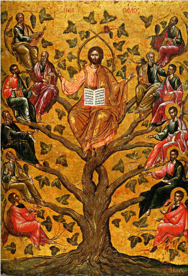
Christ The True Vine