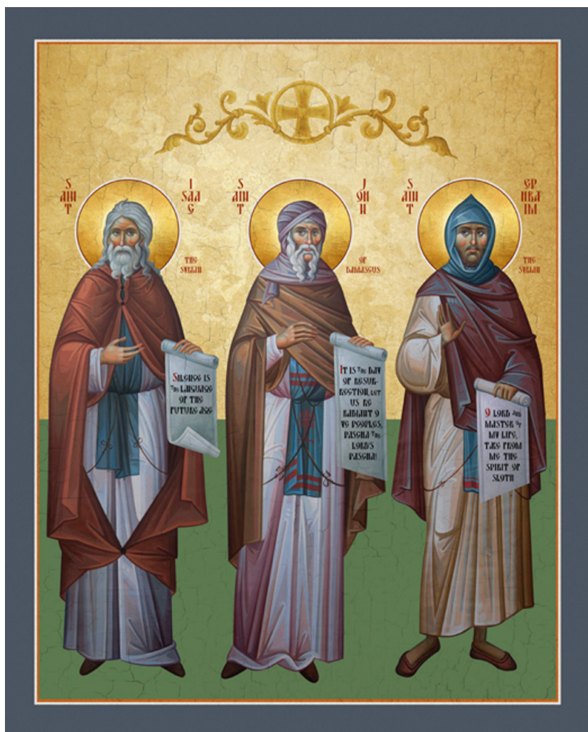
Syriac Desert Fathers